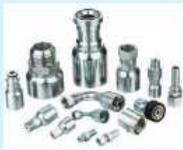
HOSE TUBING AND FITTING