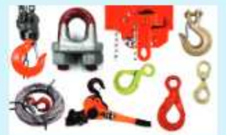
LIFTING AND RIGGING