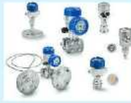
FLOW AND LEVEL