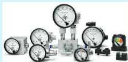
PRESSURE AND TEMPERATURE