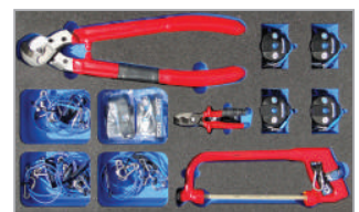
Electrical Kit - Drawer 6