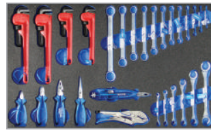
Electrical Kit - Drawer 4