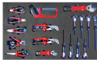
Electrical Kit - Drawer 3