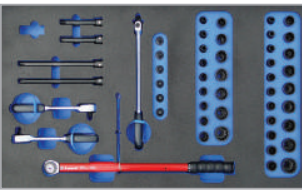
Electrical Kit - Drawer 1